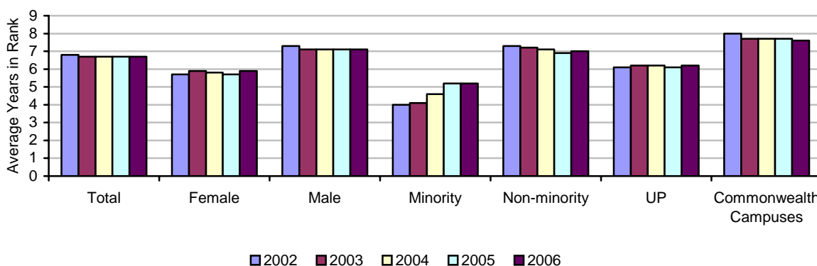
Figure 1 - Associate Professor Average Years in Rank

Minority associate professors have had and still have a shorter average time in rank compared to non-minority faculty members. Figure 1 shows that over the past five years, minority associate professors' average time in rank rose from 4.0 years to 5.2 years, but some of the variation may simply be due to small numbers in any given year. Female associate professors have had lower average years in rank than males. Compared to colleagues at University Park, Commonwealth Campus associate professors on average have more years in rank. Associate professors at the Commonwealth Campuses had been in rank for an average of 7.6 to 8.0 years, compared to about 6.1 years for University Park associate professors.